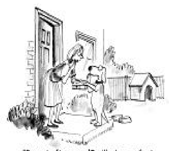
"Repeat after me: "I will wipe my feet and subdue my fleas before entering the house"."