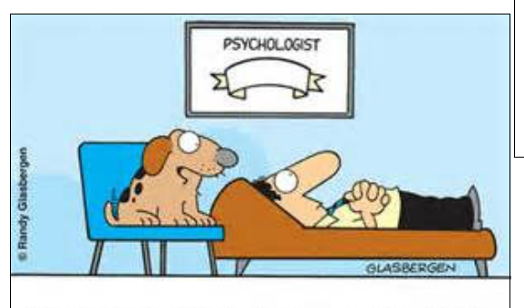
"My therapy is quite simple: I wag my tail and lick your face until you feel good about yourself again."